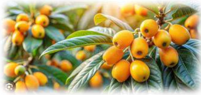
photo. There it was - the tree, covered in fruit. I am glad it got a second chance.

In today's Gospel, we hear of the barren fig tree. For three years, it has borne no fruit, and the logical response might be to cut it down. Yet, the gardener intercedes, pleading for one more year, offering to tend to it with care and patience. This image of mercy mirrors the heart of God - the great "I Am" who is not distant or indifferent but present, full of compassion and love. When Moses encounters God in the burning bush, the Lord reveals Himself as "I Am Who Am," the One who exists eternally and who is always with His people. This divine presence is not one of fear or condemnation but of steadfast love. Just as God heard the cries of His people in Egypt and responded with deliverance, so too does He hear our own cries and longs to set us free.